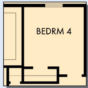
OPTIONAL BEDROOM 4 AT RETREAT