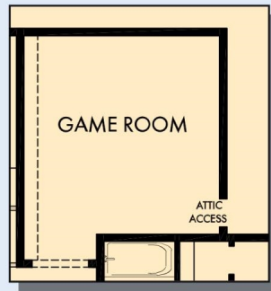
OPTIONAL GAME ROOM