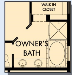
OPTIONAL DROP IN TUB WITH SEPARATE SHOWER AT OWNER'S BATH