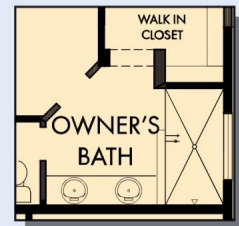
OPTIONAL SUPER SHOWER AT OWNER'S BATH