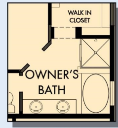
OPTIONAL SLIP IN TUB WITH SEPARATE SHOWER AT OWNER'S BATH