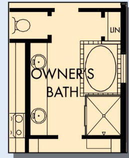
OPTIONAL SEPARATE TUB AND SHOWER AT OWNER'S BATH