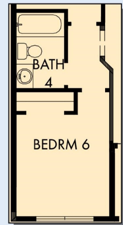
OPTIONAL BEDROOM 6 WITH BATH 4 AT STUDY