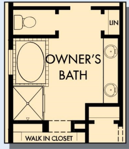
OPTIONAL DROP IN TUB WITH SEPARATE SHOWER AT OWNER'S BATH

2,577 - 2,578 sq. ft. • 4 Bedrooms • 3 Full Baths • 3 Car Garage