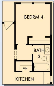
OPTIONAL BEDROOM 4 WITH BATH 3 AT STUDY