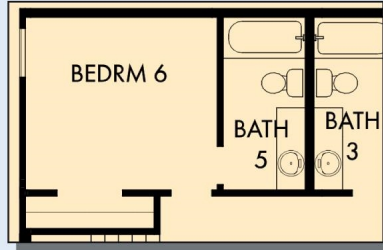
OPTIONAL BEDROOM 6 WITH BATH 5 AT RETREAT