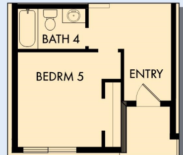
OPTIONAL BEDROOM 5 WITH BATH 5 AT STUDY