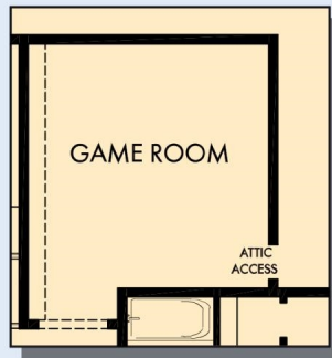
OPTIONAL GAME ROOM AT ATTIC ACCESS