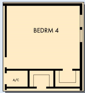
OPTIONAL BEDROOM 4 AT TV ROOM