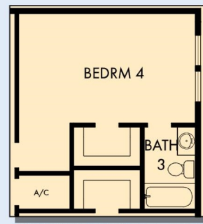
OPTIONAL BEDROOM 4 WITH BATH 3 AT TV ROOM