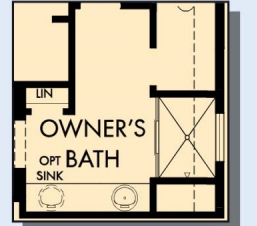
OPTIONAL SHOWER AT OWNER'S BATH