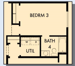
OPTIONAL BEDROOM 3 WITH BATH 4 AT STUDY