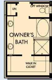
OPTIONAL SEPARATE TUB AND SHOWER AT OWNER'S BATH