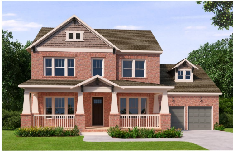
5339 NAS - B