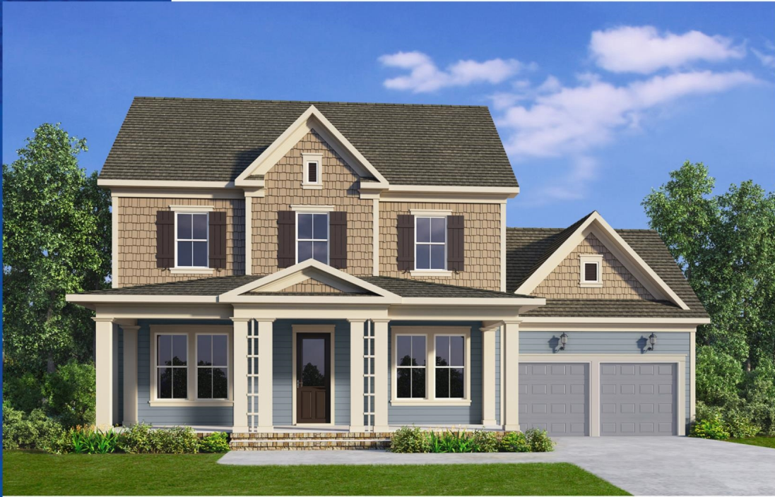
5339 NAS - A