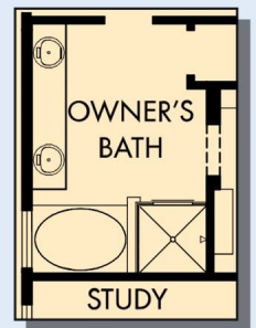
OPTIONAL SLIP IN TUB WITH SEPARATE SHOWER AT OWNER'S BATH