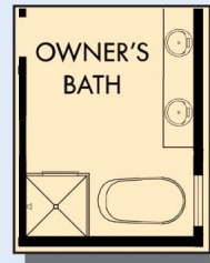
OPTIONAL FREE STANDING TUB WITH SEPARATE SHOWER AT OWNER'S BATH