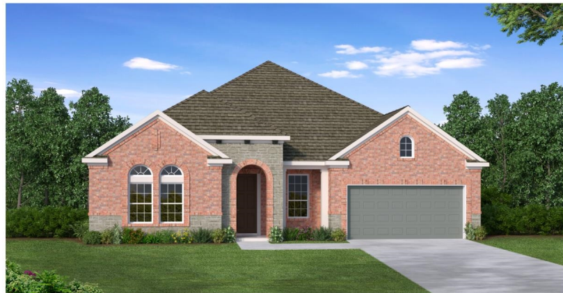
6640 DAL - B