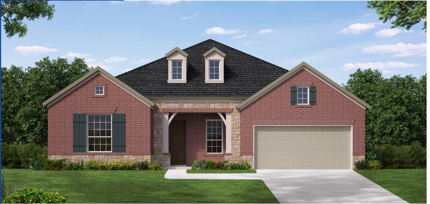
6640 DAL - A