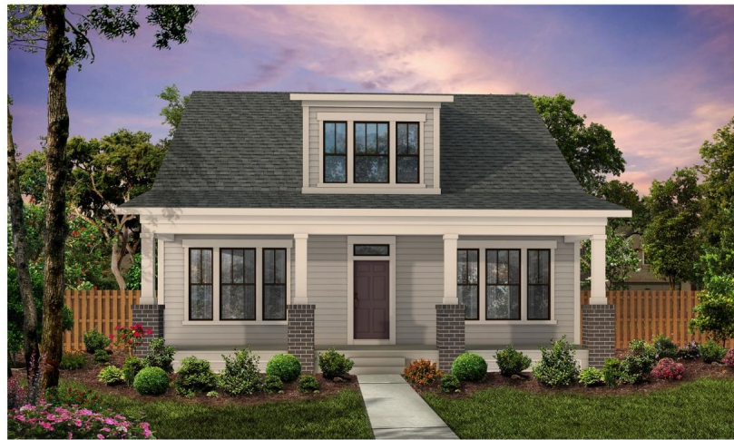
7886CSC - B