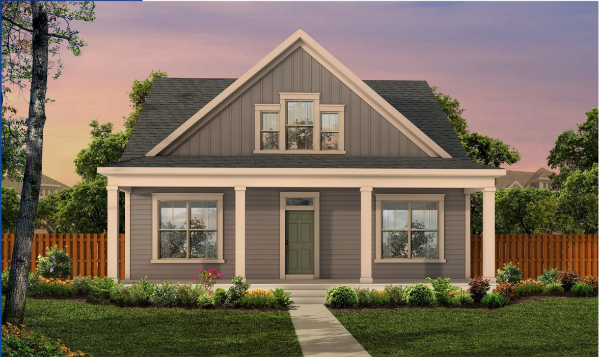
7886CSC - A