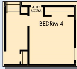
OPTIONAL BEDROOM 4 AT RETREAT