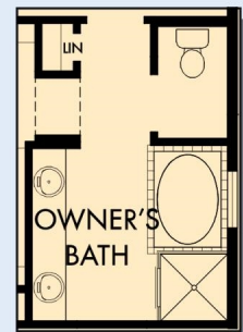
OPTIONAL DROP IN TUB WITH SEPARATE SHOWER AT OWNER'S BATH