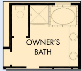
OPTIONAL OWNER'S BATH WITH SEPARATE TUB AND SHOWER