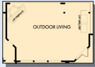
OPTIONAL OUTDOOR LIVING

4,186 - 4,194 sq. ft. • 4 - 6 Bedrooms • 4 - 5 Full Baths • 3 Car Garage