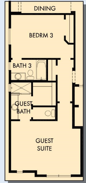
OPTIONAL GUEST SUITE AT BEDROOM 4