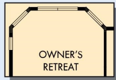
OPTIONAL BAY WINDOW AT OWNER'S RETREAT

2,678 - 2,679 sq. ft. • 4 Bedrooms • 3 Full Baths • 1 Half Bath • 2 Car Garage