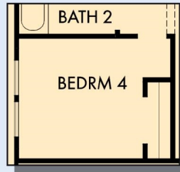
OPTIONAL BEDROOM 4 AT STUDY

2,291 - 2,321 sq. ft. • 3 - 4 Bedrooms • 3 Full Baths • 2 Car Garage