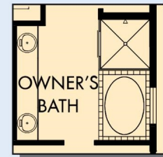
OPTIONAL DROP-IN TUB AND SEPARATE SHOWER AT OWNER'S BATH