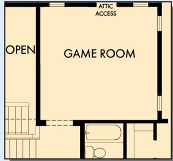
OPTIONAL GAME ROOM