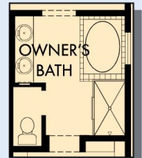
OPTIONAL DROP-IN TUB WITH SEPARATE SHOWER AT OWNER'S BATH