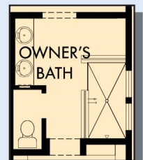
OPTIONAL SUPER SHOWER AT OWNER'S BATH