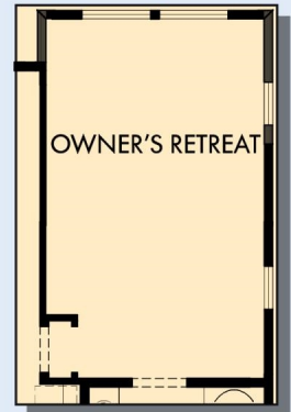
OPTIONAL EXTENDED OWNER'S RETREAT