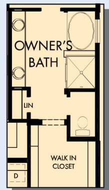
OPTIONAL TUB AND SHOWER AT OWNER'S BATH