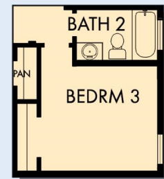
OPTIONAL BEDROOM 3 AT STUDY