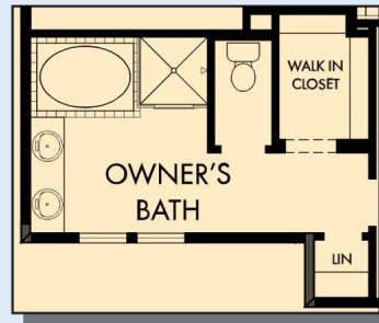
OPTIONAL SEPARATE TUB AND SHOWER AT OWNER'S BATH