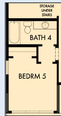
OPTIONAL BEDROOM 5 WITH BATH 4 AT STUDY