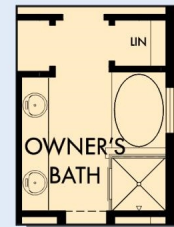
OPTIONAL SLIDE-IN TUB WITH SEPARATE SHOWER AT OWNER'S BATH