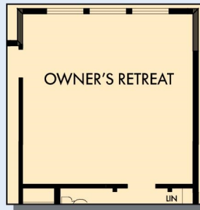
OPTIONAL EXTENDED OWNER'S RETREAT