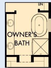
OPTIONAL FREE STANDING TUB WITH SEPARATE SHOWER AT OWNER'S BATH