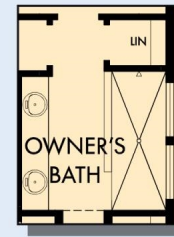
OPTIONAL SUPER SHOWER AT OWNER'S BATH