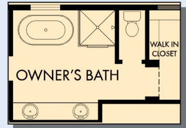
OPTIONAL FREE STANDNING TUB AND SHOWER AT OWNER'S BATH