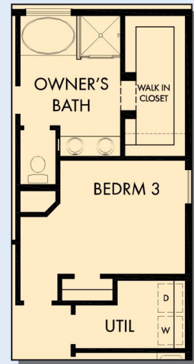
OPTIONAL OWNER'S BATH