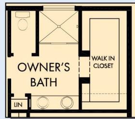
OPTIONAL SUPER SHOWER