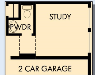
OPTIONAL POWDER BATH AT STUDY