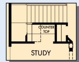
OPTIONAL POCKET OFFICE AT STUDY