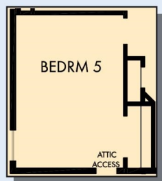
OPTIONAL BEDROOM 5 AT RETREAT