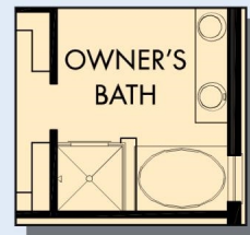
OPTIONAL SLIP IN TUB WITH SEPARATE SHOWER AT OWNER'S BATH