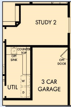
OPTIONAL STUDY 2 AT BEDROOM 2