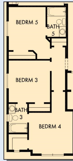
OPTIONAL BEDROOM 5 AT STUDY