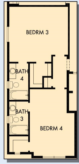
OPTIONAL EXTENDED BEDROOMS 3 AND 4