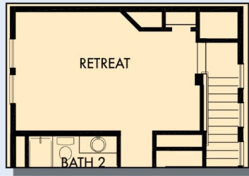
OPTIONAL RETREAT AT BEDROOM 4