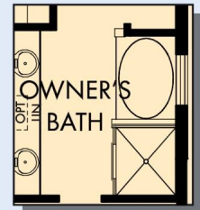
OPTIONAL TUB AND SHOWER AT OWNER'S BATH