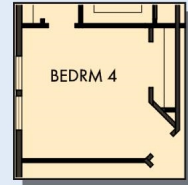
OPTIONAL BEDROOM 4 AT RETREAT