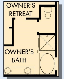
OPTIONAL SLIDE-IN TUB WITH SEPARATE SHOWER AT OWNER'S BATH