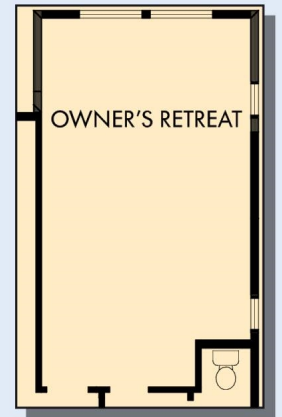
OPTIONAL EXTENDED OWNER'S RETREAT