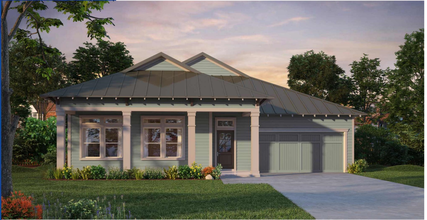
2160 HOU - A