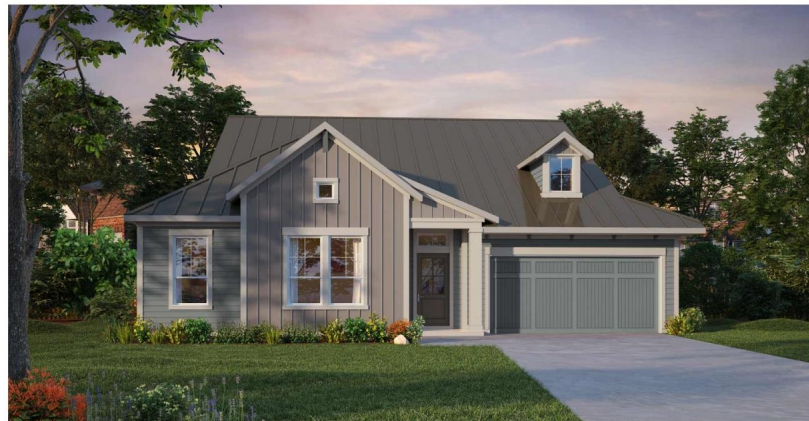
2160 HOU - B