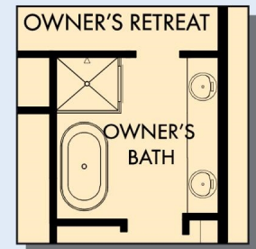
OPTIONAL FREE STANDING TUB WITH SEPARATE SHOWER AT OWNER'S BATH