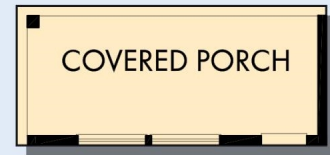
COVERED PORCH OPTIONAL COVERED PORCH AT FAMILY