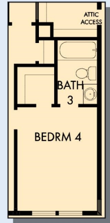
OPTIONAL BEDROOM 4 WITH BATH 3 AT RETREAT