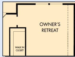
OWNER'S RETREAT WALK IN CLOSET OPTIONAL EXTENDED OWNER'S RETREAT