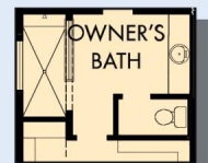
OWNER'S SUPER SHOWER AT OWNERS BATH