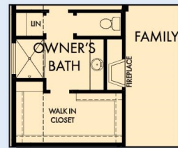
OPTIONAL FIREPLACE AT FAMILY