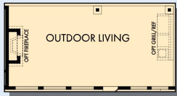
OPTIONAL OUTDOOR LIVING

2,460 - 2,614 sq. ft. • 4 Bedrooms • 3 Full Baths • 2 - 3 Car Garage