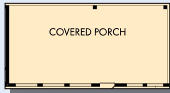
OPTIONAL EXTENDED COVERED PORCH