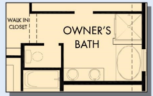
OPTIONAL SLIP-IN TUB WITH SEPARATE SHOWER AT OWNER'S BATH

2,255 sq. ft. • 4 Bedrooms • 3 Full Baths • 2 - 3 Car Garage