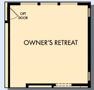
OPTIONAL EXTENDED OWNER'S RETREAT