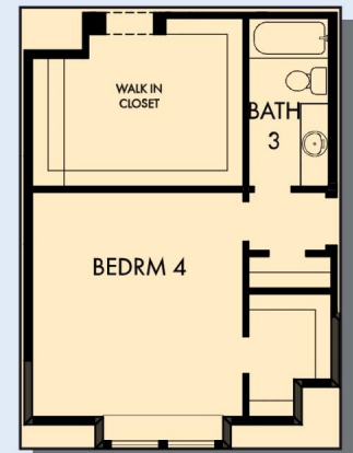
OPTIONAL BEDROOM 4 WITH BATH 3 AT STUDY