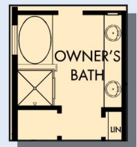
OPTIONAL SEPARATE TUB AND SHOWER AT OWNER'S BATH