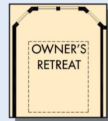
OPTIONAL BAY WINDOW AT OWNER'S RETREAT