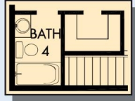
OPTIONAL BATH 4 AT HALF BATH